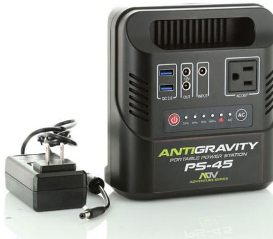
AC CHARGER PS-45 PORTABLE POWER STATION

(Can also be charged with optional Solar Panels such as the Antigravity XS-60 and XS-100)