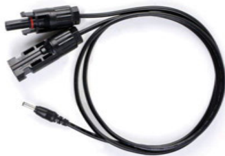
MC4 TO DC5521 CHARGING CABLE