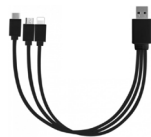
3-INTO-1 USB CABLE