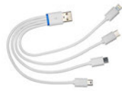
4-INTO-1 USB CABLE